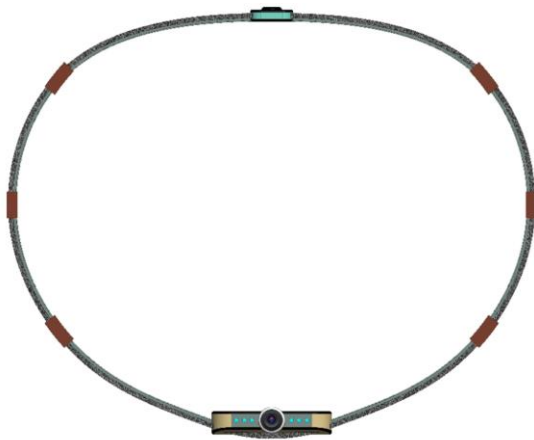
Diagram C: Front View

The above two diagrams A and B shows the Top View and Bottom View of the wandering animal controlling device belt.