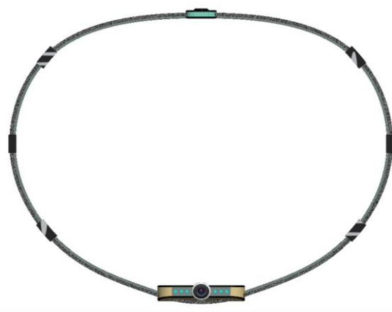
Diagram D: Rear View

The above diagrams C and D shows the Front and Rear view of the wandering animal controlling device belt. It shows the use of camera sensors used from both the sides of belt front view as well as rear view making these views of similar kind.